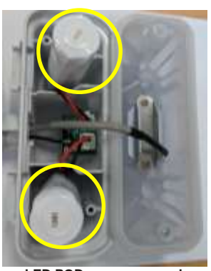
LED POD cover removed. Batteries highlighted