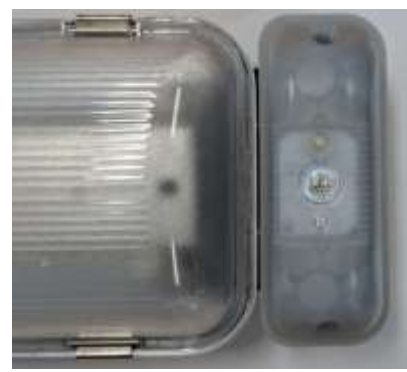
LED POD location on batten